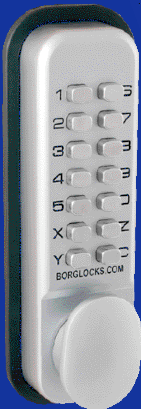
2000 SC Front