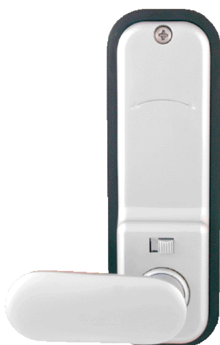
2200 Open Back

The BL2000 series is a range of fully mechanical pushbutton coded locks. The ergonomic design (originated by Borg, now imitated by many) and simple operating procedure ensures access for authorised personnel only.